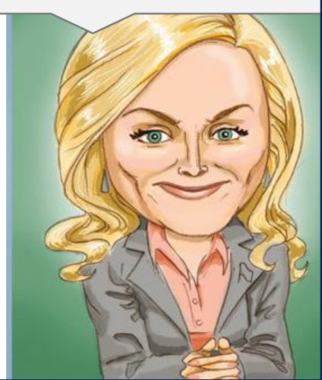
" Parks & Rec"

Dept. of Parks' internal reports show that there are more fields than needed for at least 20 years. County mismanagement of field scheduling creates the false public perception of insufficient fields. The Parks Dept is keeping all this information from the public. A summary of the Parks Dept data is on parks4everyone.org